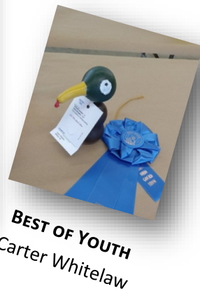
BEST OF YOUTH Carter Whitelaw