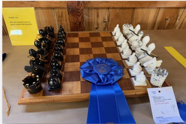
BEST OF DIVISION III Steve Travis