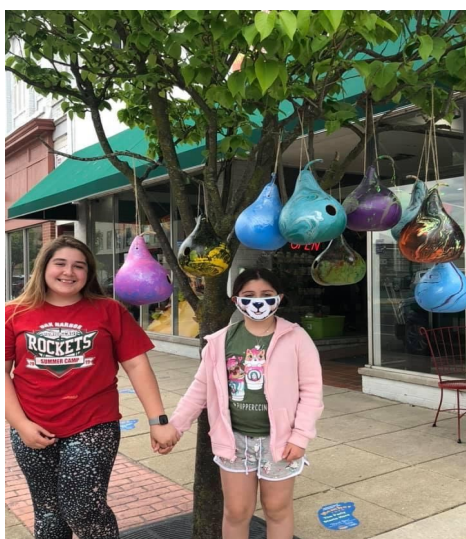
Satisfied customers at Pottery Perfection Done Your Way and The Gourd Connection, Freemont, Ohio.

My husband and I own and operate a paint your own walk-in Pottery Studio named Pottery Perfection Done Your Way, in Freemont, Ohio. We are open 7 days a week. We specialize and host lots of parties. We have classes and workshops for pottery, clay hand builds, wood cut out, canvas and of course my true love..... Gourds!!! Prior to opening on April Fool's Day 2019 I was a hairdresser of 37 years and my husband a 4th generation career meat cutter of a family owned meat processing plant. I struggled with spine, ankle and shoulder issues in the salon industry so we took a leap of faith and purchase our Pottery Studio!