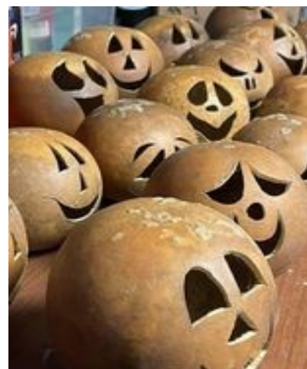
Cannonball gourds, cleaned and carved and ready for ink dyes at Ghoulish School. A Kids night out, Parents night off, Halloween themed party.