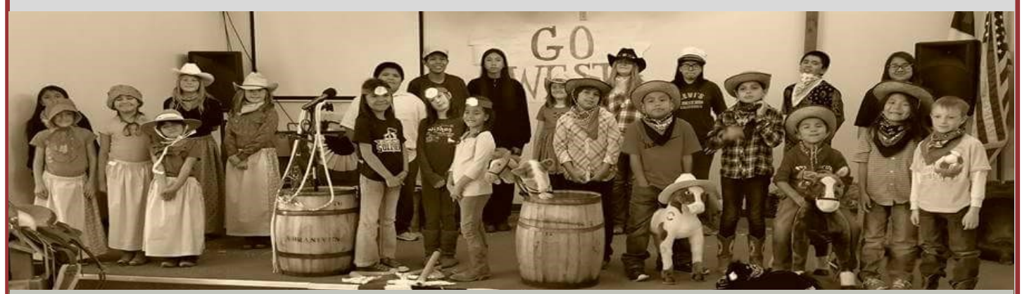
THE CHILDREN PERFORMED A WESTERN THEME PLAY FOR US - DRESS REHEARSAL.

the gourd to spin until acted upon by gravity and friction. Bet you even learned something there! We also took 40 Egg Gourds for the teacher to use in a craft of what ever the children would like to do at a later date. The lesson ended with scripture from the bible where the plant that grew up over Johna was a "Gourd" to give him shade. Johna 4:6 and "The Deadly Stew", where the men went out and gathered a lap full of wild gourds, and came and cut them up into the pot of stew, not knowing what they were. When they went to eat it, they said, "Man of God, there is Death in this pot!" And they could not eat it. So they put flour in the pot and served it to the men and they were able to eat it. 2 Kings 4:38-42