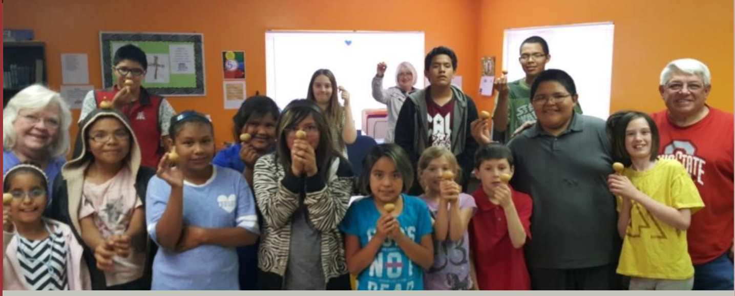
EACH STUDENT WAS GIVEN A SPINNER GOURD!