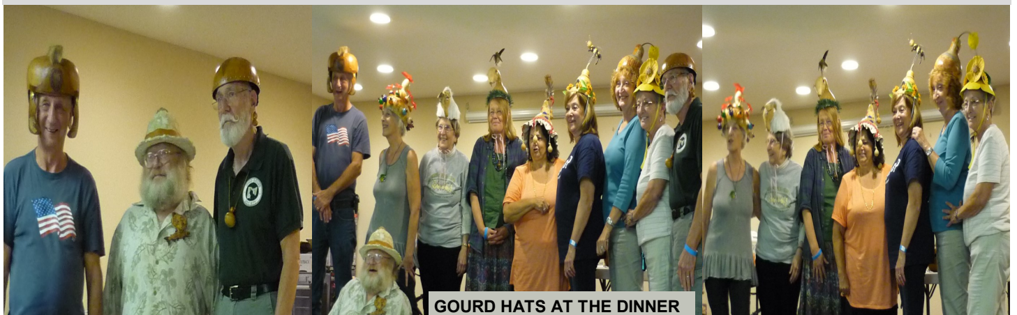
GOURD HATS AT THE DINNER