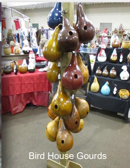
Bird House Gourds