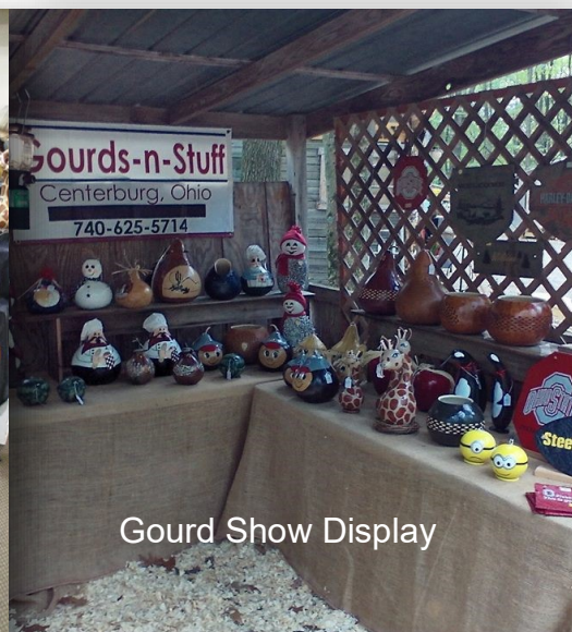
Gourd Show Display